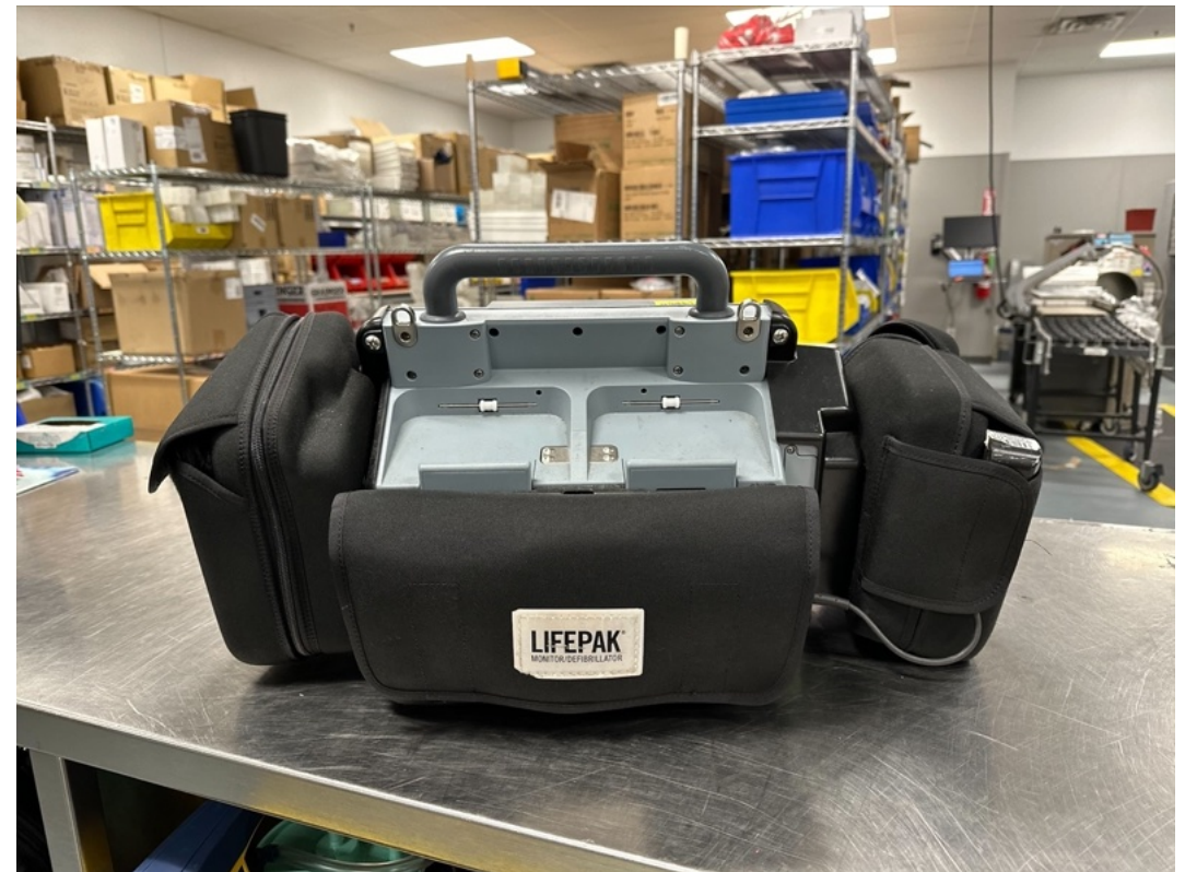
The LP-15 acts as a defibrillator if a patient is in cardiac arrest