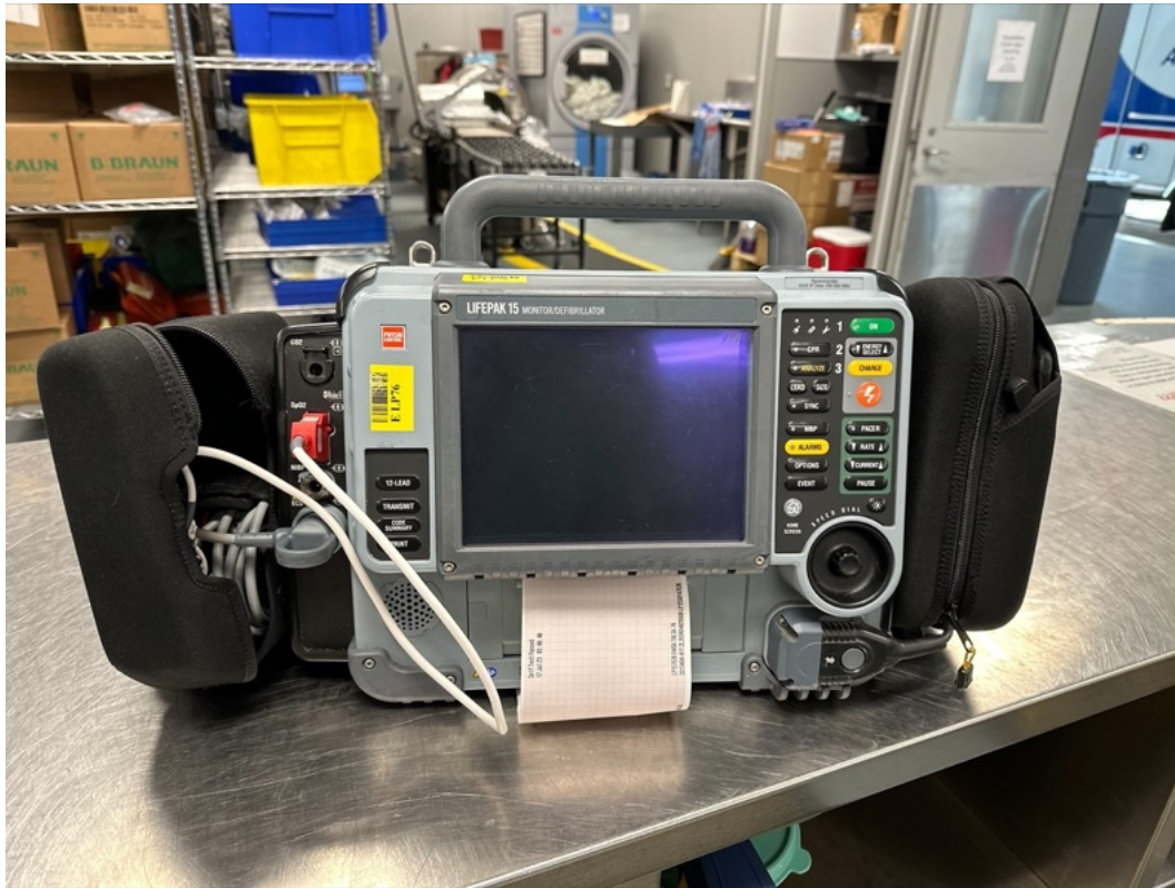
The LP-15 can do 12-lead EKG with a print-off of the rhythm that is sent ahead to the receiving hospital

The LP-15 is used to monitor patient's heart rate, oxygen saturation & CO2 levels.