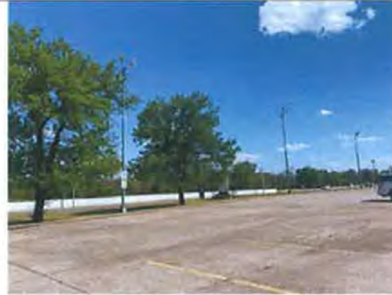
Parking along Sooner and Pole Mounted Security Lights