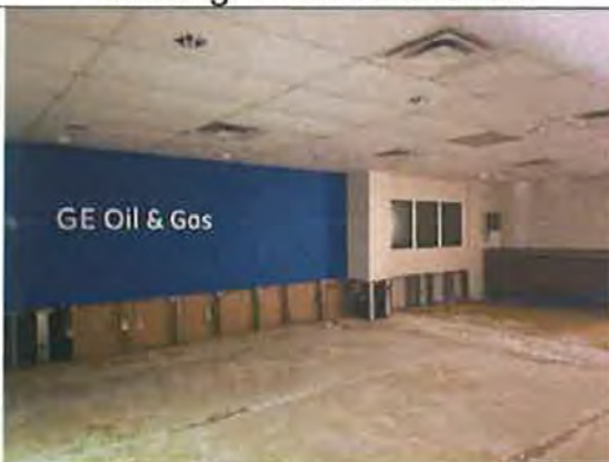
Conference / Training Room (damage)