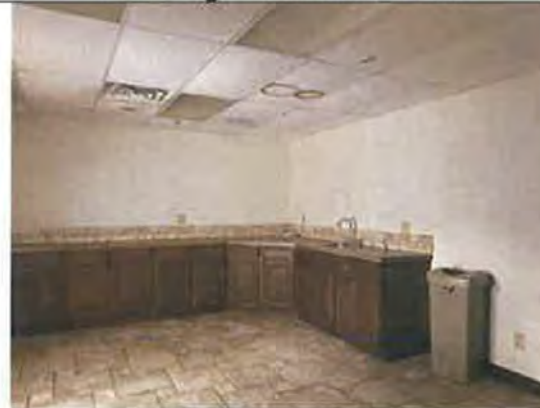
Building 2 Break room