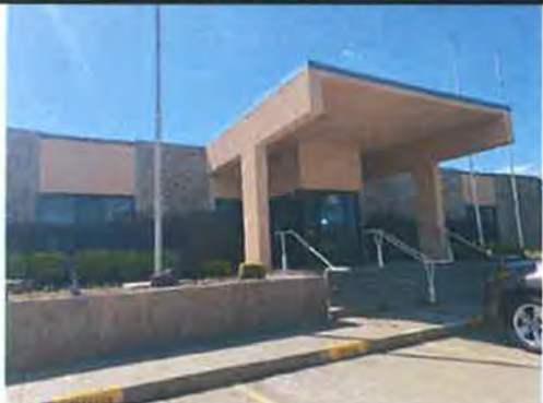
Building 1 – Covered Entrance