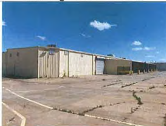
Building 1 West Elevation