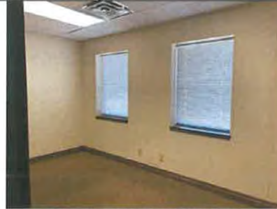
Building 2 Private Office