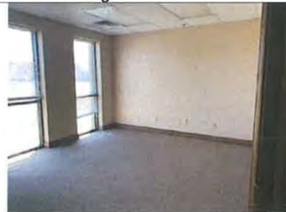
Typical Private Office (no water damage)