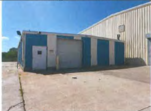
Building 3 - East Elevation