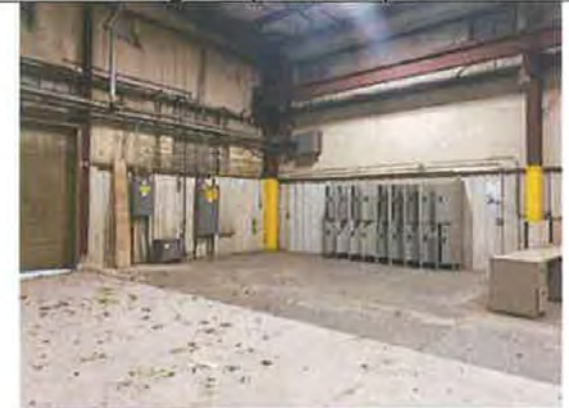
Building 2 Warehouse - Lockers