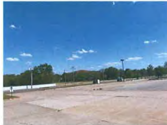
Driveway from Sooner at southern boundary line