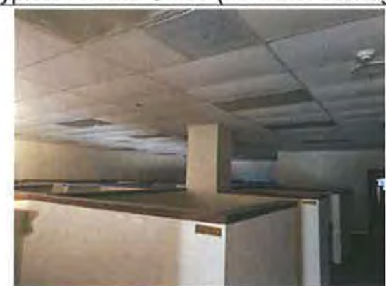
Typical bull pen office area