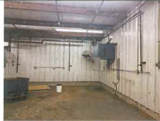
Building 3 - Interior