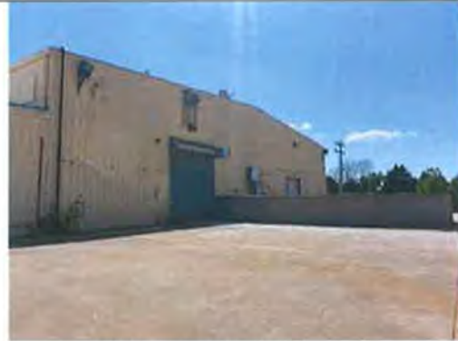
Building 2 North Elevation