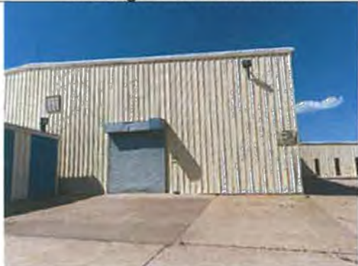
Building 2 South Elevation