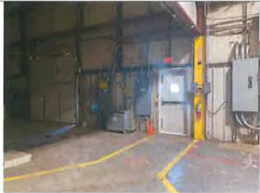
Building 2 Warehouse