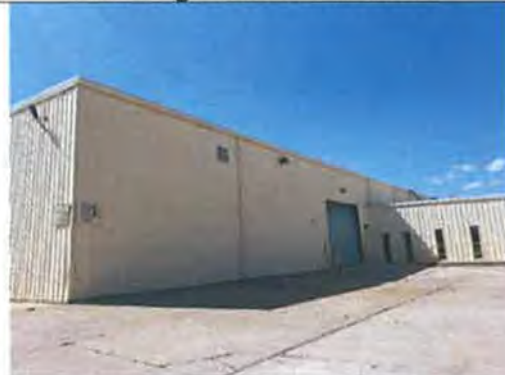
Building 2 East Elevation