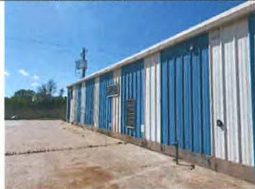
Building 3 - South Elevation