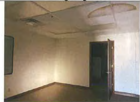
Stained Ceiling Tiles