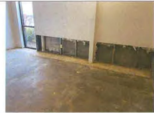
Private Office with water damage