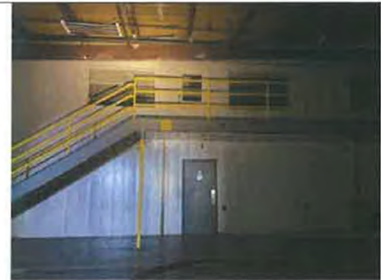
Two story (mezzanine) office