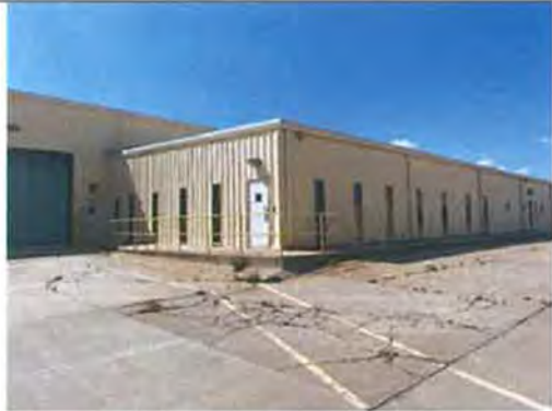
Building 2 East Elevation