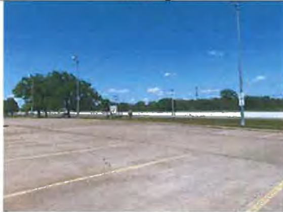
Parking along Sooner, Pole Mounted Security Lights, Monument-style Sign and Broker's Listing Sign