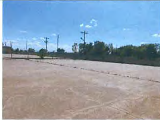
Concrete yard and perimeter chain link fencing