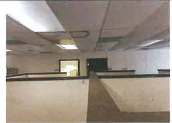
Building 2 Open, Bullpen area