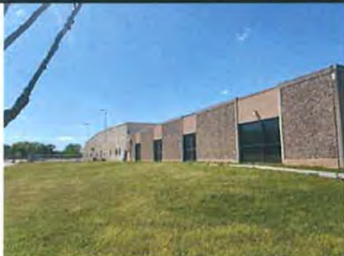
Building 1 - South Elevation