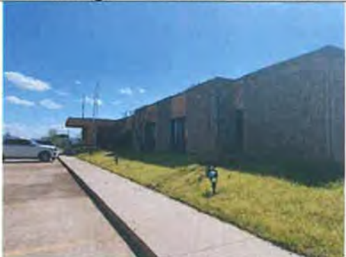
Building 1 East Elevation