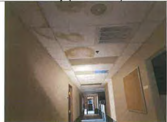
Stained Ceiling Tiles