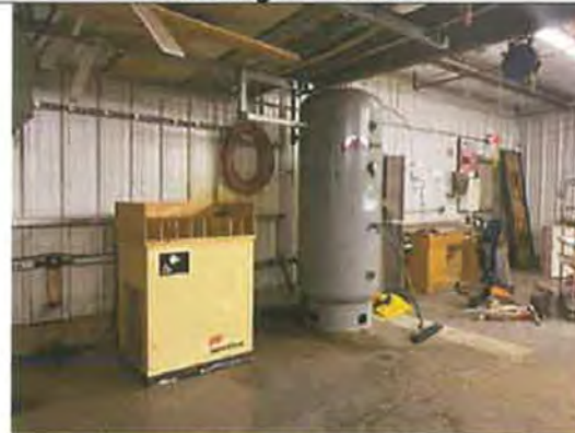
Building 3 - Interior