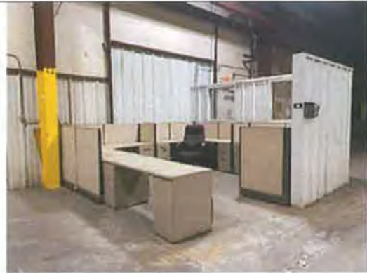
Building 2 Desks, Personal Property