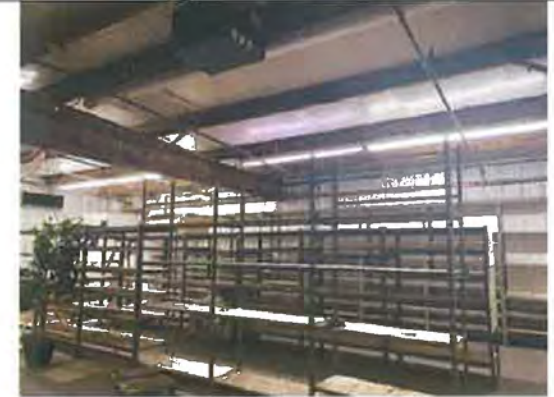
Building 3 - Interior