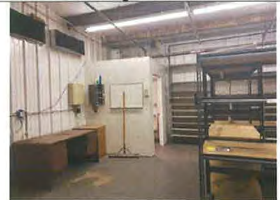
Building 3 - Interior