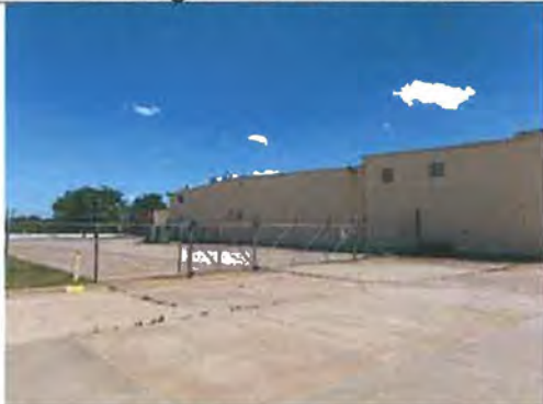
Building 1 North Elevation