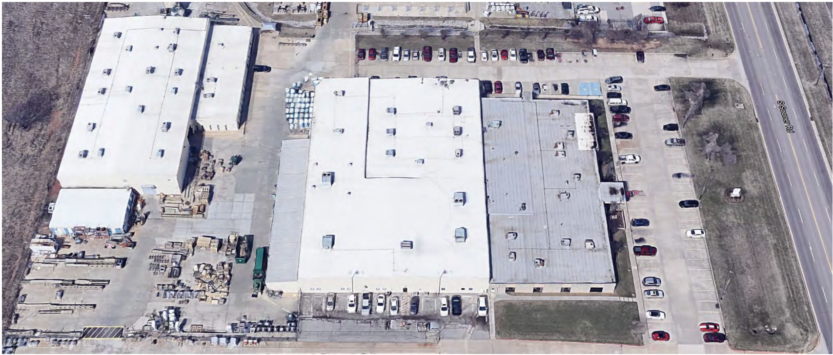
Figure 2: From the south looking north